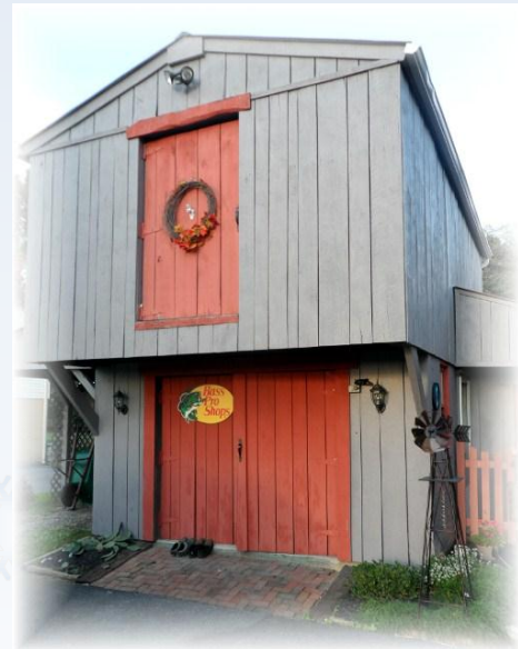
This year we painted our barn and barn roof.