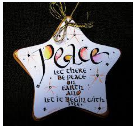
Peace to you and yours from the Webers