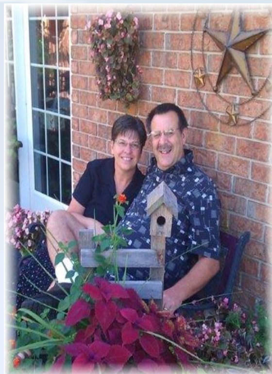
Relaxing on the north side of our home.

In October we traveled through New England and stayed mostly in the mountains of Vermont, such a special place in the fall; brilliant foliage everywhere we looked. New England will always have a special place in our hearts after living in Massachusetts for nearly 8 years.