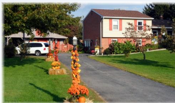
Our home decorated for the Autumn season